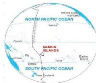
The Samoan Islands are located in the South Pacific Ocean midway between Hawaii and Australia