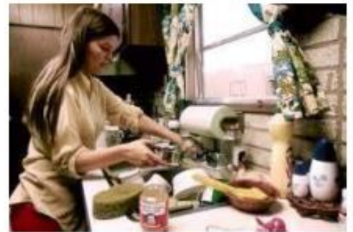
All the household work done by women at home is neither respected nor paid and remains invisible