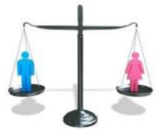
One of the Directive Principles of the State Policy is equal pay for equal work done by men and women