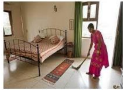
Domestic workers are poorly paid as their work is not considered to be a skilled job