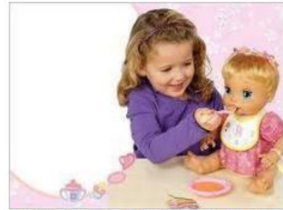
Societies influence the bringing up of boys and girls. Usually girls are always given dolls to play with.